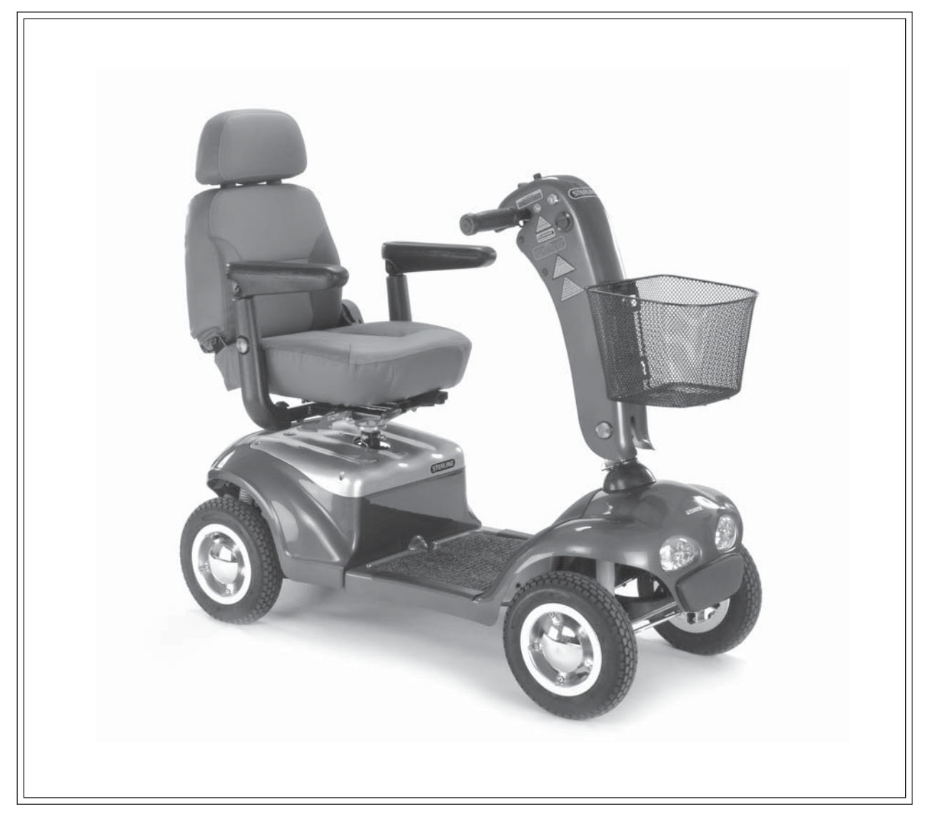
How to use this manual

We at Sunrise Medical want you to get the best out of your scooter. This Owner's Manual will familiarise you with the scooter and its features. It contains guidance on everyday usage and general care in addition to information on the high quality standards which we adhere to and details about the warranty.