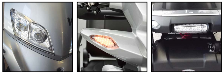
Modern LED lighting system delivers brilliant light with less power consumption