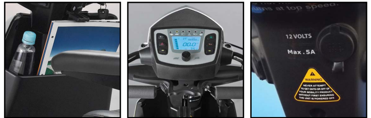
More space for storage