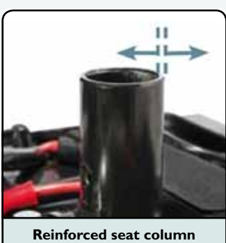
It ensures stability and safety while seated.