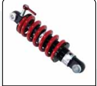
Unique suspension system It has proven itself in the professional mountain biking industry and allows for simple independent user adjustment.