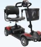
Scout 20 Amp