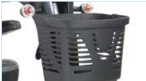
Stylish New Basket