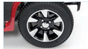
New Design Large Alloy Wheels