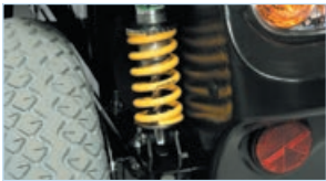
All Round Suspension