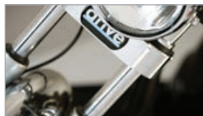
Telescopic Front Motorcycle Suspension For Optimal Handling