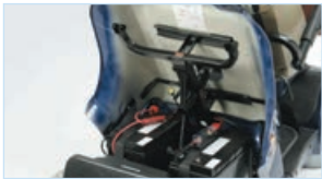
Lift Up Frame Provides Easy Access For Maintenance