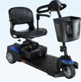
Scout 3 Wheel