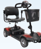
Scout 12 Amp