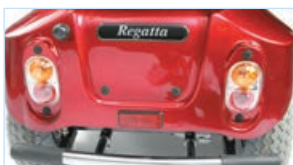
Fully Functioning Lights & Indicators For Road Use