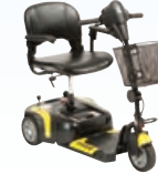
Prism 3 Wheel