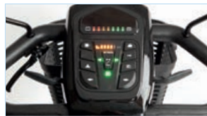
Modern Dash Design