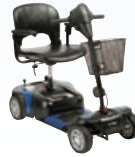
Prism 4 Wheel