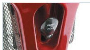
One Touch Tiller Adjustment