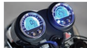
Trip Computer With Odometer