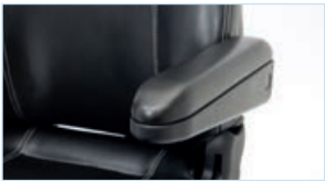
Width & Angle Adjustable Armrests