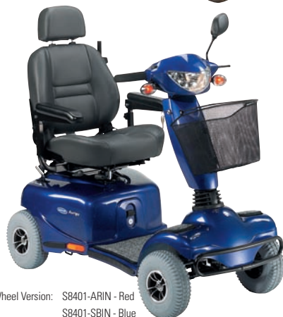
4-Wheel Version: S8401-ARIN - Red S8401-SBIN - Blue

The Invacare® Auriga is highly maneuverable, offering spacious legroom, a powerful motor and a maximum user weight of 330 lbs. The Auriga ensures a safe driving experience with controls that are adjustable and easy to read and buttons that are easy to press and respond immediately. With many adjustable options to meet your requirements, your driving position is completely adjustable for your safety, comfort and for easy transfer. The Auriga is available in a 3-wheel version and a 4-wheel version. Designed for comfort and safety, the Auriga allows you daily independence in style.