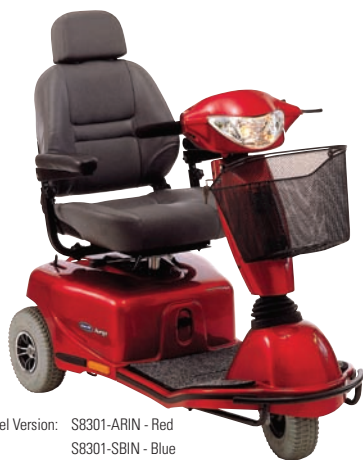
3-Wheel Version: S8301-ARIN - Red S8301-SBIN - Blue

Canada 570 Matheson Blvd. E. Unit 8 Mississauga, Ontario L4Z 4G4 Canada (800) 668-5324