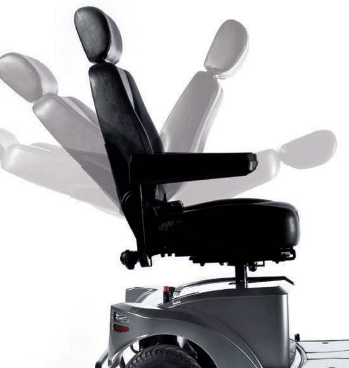
→ Quick backrest angle adjustment Standard on all models

The S-SERIES advanced seating solution, takes comfort to the highest level, from the seat height, depth and recline adjustments, to the flip up, width, angle and depth adjustable comfort armrests – every feature has been designed for comfort – for you.