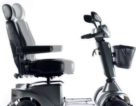
→ Infinite seat depth adjustable Standard on all models