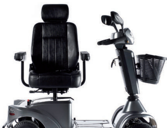
→ Seat rotation enables comfortable transfers Standard on all models