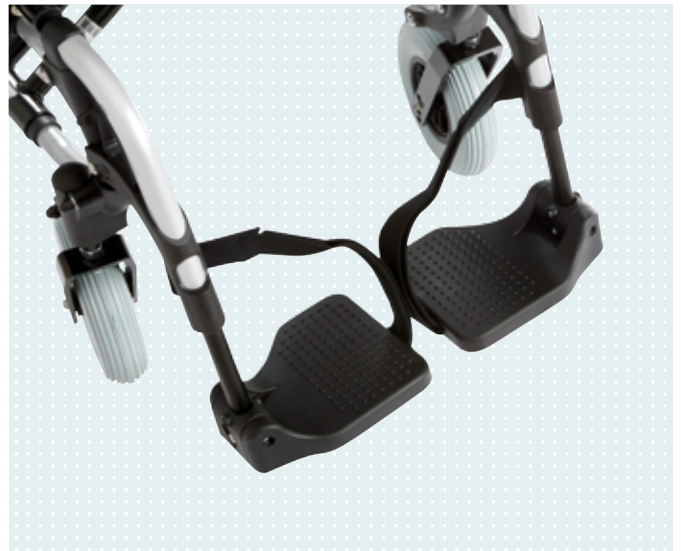
• The segmented footplate is angle-adjustable and flips up