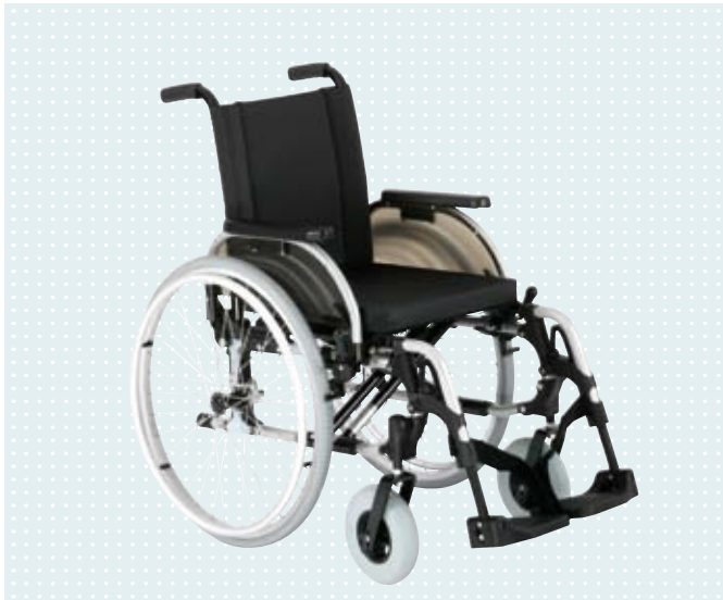
• Start M1 Intro with standard equipment