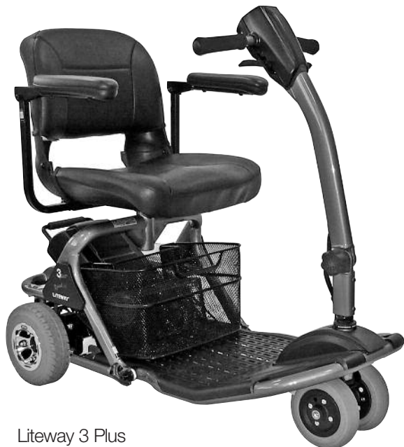
Liteway 3 Plus