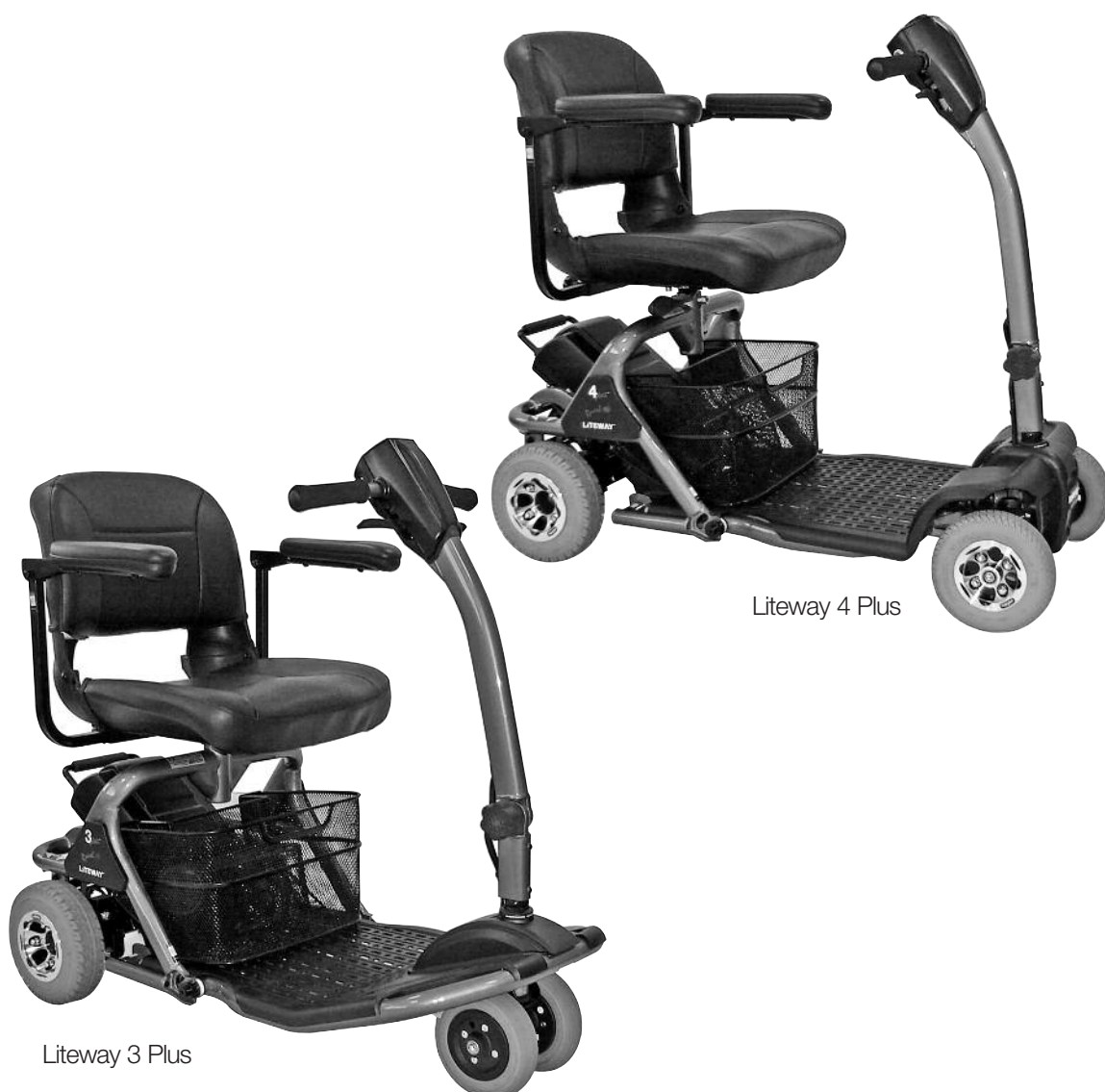
Liteway 3 Plus