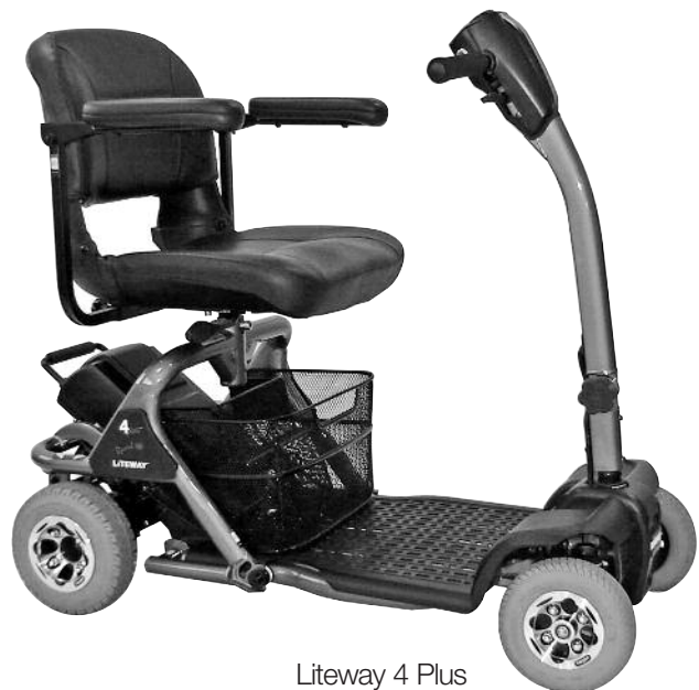
Liteway 4 Plus

Electric Mobility Euro Ltd offers these lightweight, manoeuvrable scooters for convenient indoor and outdoor use. They can be easily and quickly dismantled for transporting in the boot of a car. So long as your scooter is maintained and operated in accordance with this manual it should last for many years, and provide you with freedom and independence.