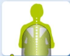
Shoulder region support.