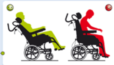
Chair should be tilted backwards.