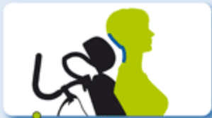
Head support placed under the top of neck.