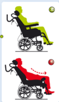
Seat should be tilted backwards.