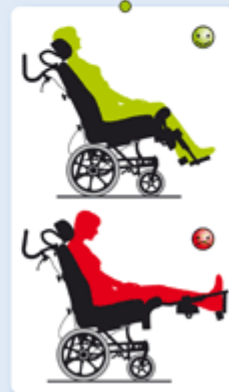
Backrest should be reclined when legrests are angled upwards.