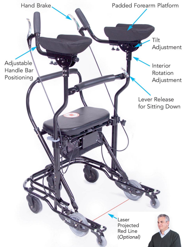
Model #: US-PC2-PL

Ideal for Stooped Posture, weak upper body, stroke, brain injury. Highly adjustable for optimal setup.