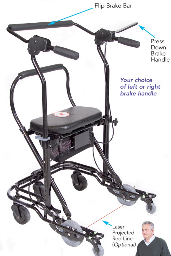
Model #: US-PC2-PD

Ideal for those with weak or no hand strength to squeeze a standard hand brake. To go, press down on the brake handle or the flip bar. Choose left or right brake handle.