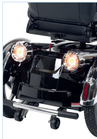
All round lighting