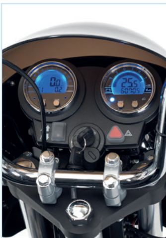
Twin dial digital dash