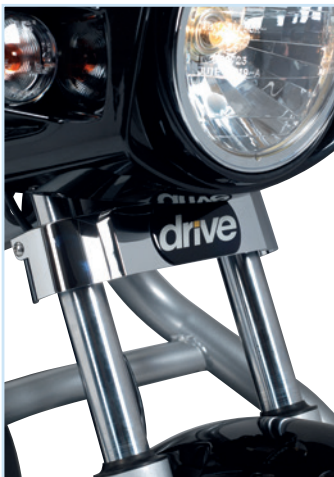
Telescopic front motorbike suspension for optimal handling