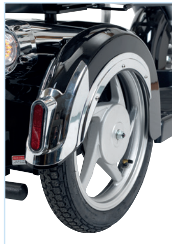
Motorcycle style wheels with chrome mud guards