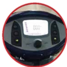
New Anti Glare LCD Screen