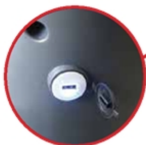
Handy USB fitting