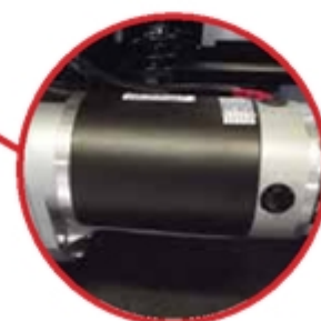
Powerful 4 Pole Motor