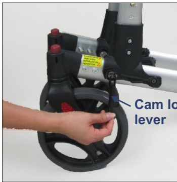
Cam lock lever

2. Lock the handle tubing upright by flipping over the camlock lever