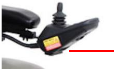
Battery Charger Plug-in under hand control